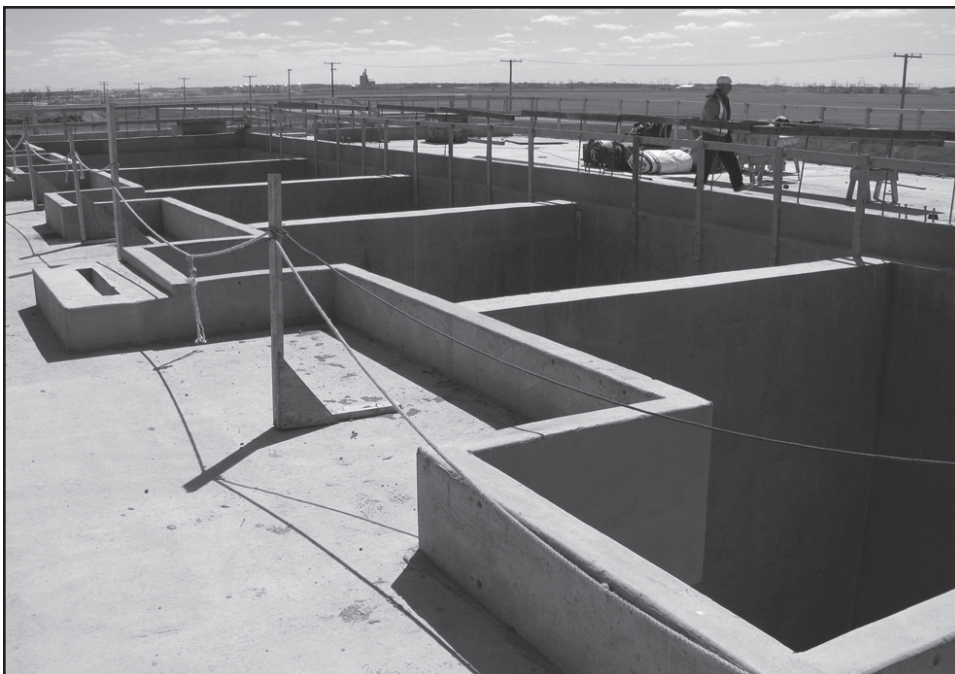
Yorkton's Water Treatment Plant under construction.