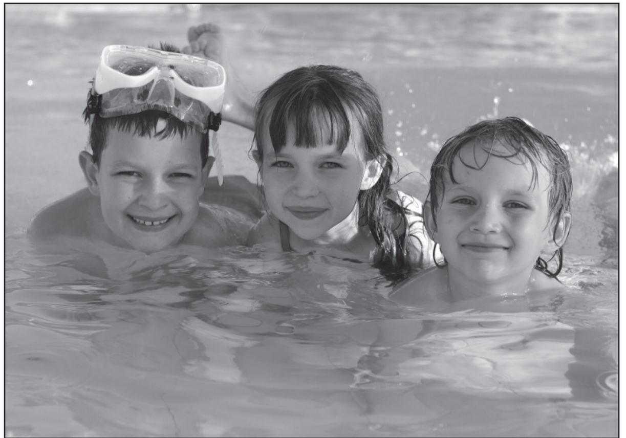
Saskatchewan kids will be having fun in the sun this summer at local municipal recreational facilities.

For more information on the presentations delivered by MCDP or to make suggestions for future workshops visit www.municipalcapacity.ca