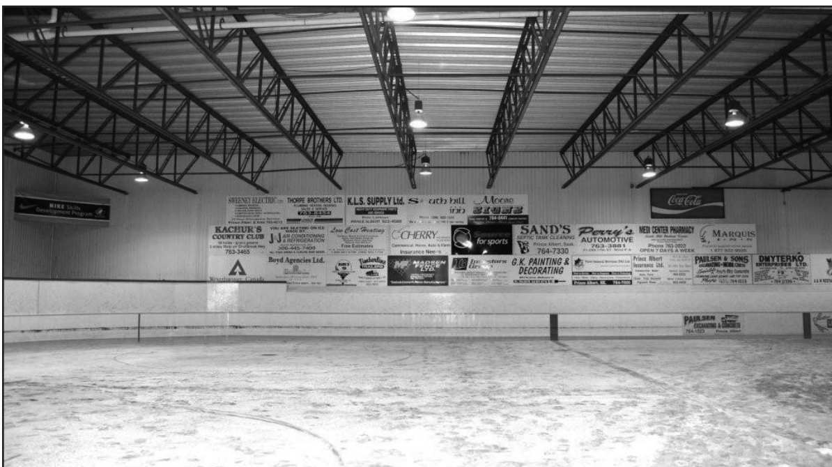
The well utilized NRRC rink has hosted hockey tournaments with over 600 participants.

For more information, visit www.municipalawards.ca