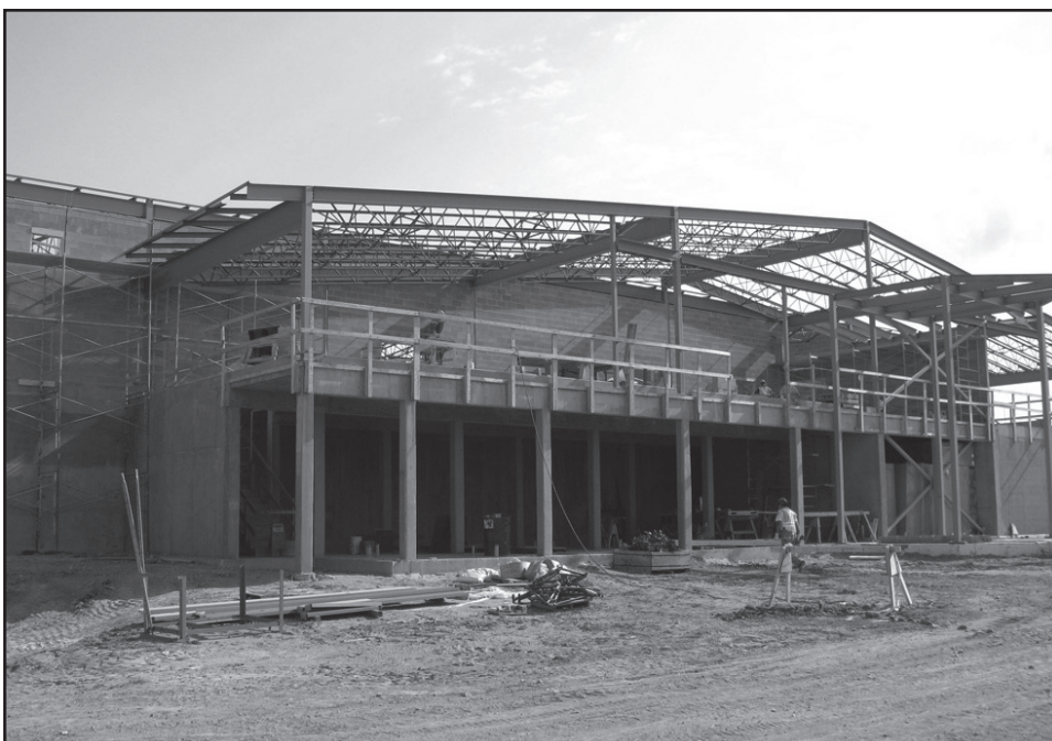
The City has used a loan from the Saskatchewan Infrastructure Growth Initiative (SIGI) to fund the Queen Street Water Treatment Plant project.