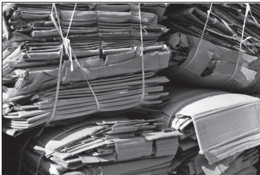
Eligible municipalities that have been stockpiling paper and cardboard will soon be getting some relief through the Bridge Funding Recycling Program

As funding under this program continues to be dispersed, SUMA is looking forward to being better able to represent the urban interest in recycling and waste management. If you would like more detailed information on the program, funding categories, and FAQs, please visit our website at www.saskmunicipalrecycling.ca